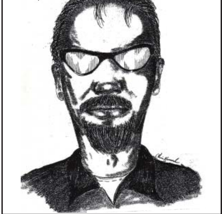
This sketch is of the suspect. However he was described as wearing a ballcap and a black t-shirt with a motorcycle on the front.