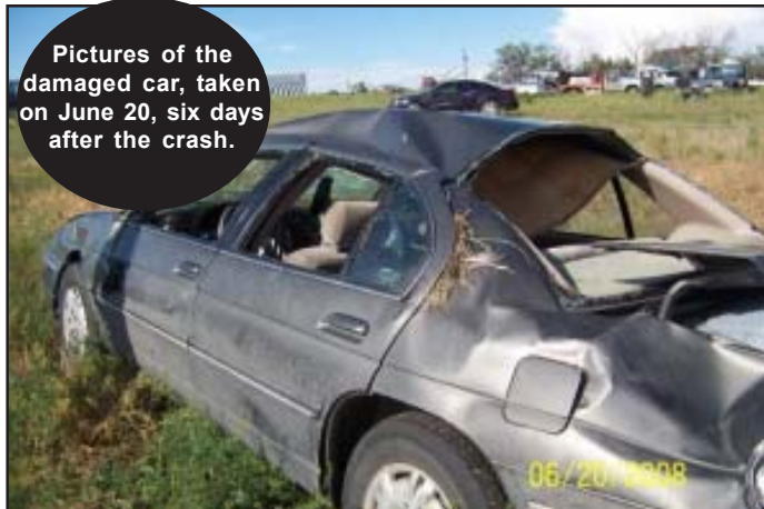
Pictures of the damaged car, taken on June 20, six days after the crash.

Normally not but when government officials like a county attorney refuse to turn over public records without a legal fight, usually something stinks in Denmark. Because of the other times provided by the WHP investigator, it would appear