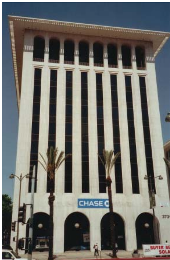
3731 Wilshire Blvd., Los Angeles, California

The note taped on the door at 3731 Wilshire Blvd., Suite 506, Los Angeles, California (allegedly Preston University's “campus” now) says: PLEASE LEAVE PACKAGES FOR #506 AT ROOM #500 ON THE FLOOR. THANKS.