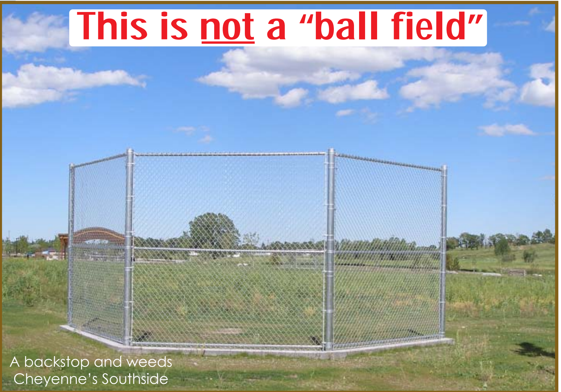
A backstop and weeds Cheyenne's Southside