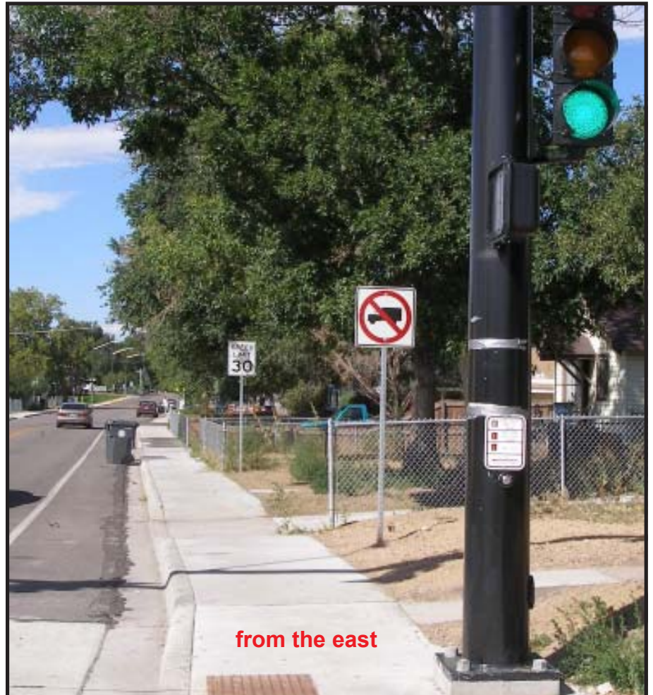
from the east